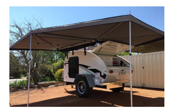
Roof Mount Annexe