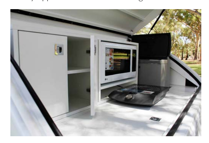
Galley Appliance Cabinet with Fridge