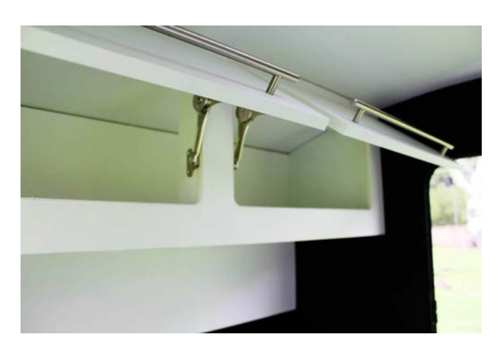
Interior View of Cabinets