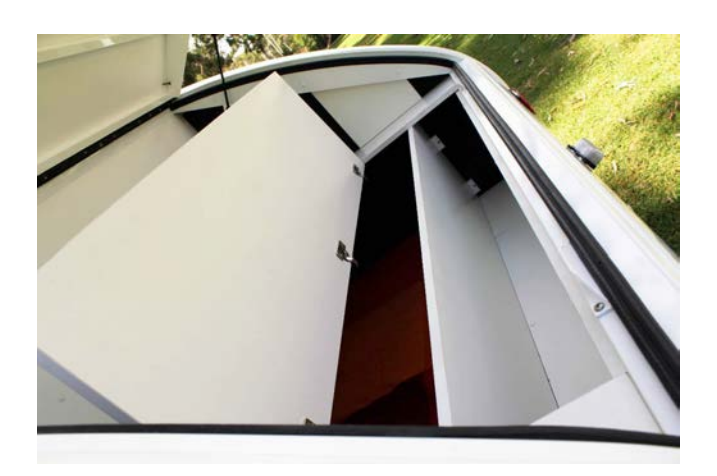
Under Bench Storage