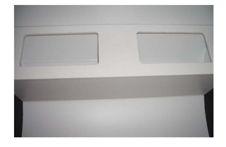
Front Storage Cabinet