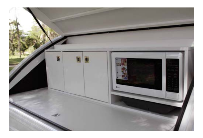
Galley Appliance Cabinet